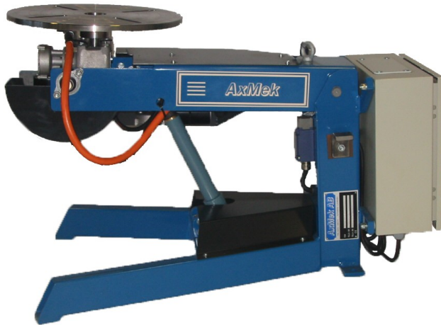
Flat top surface