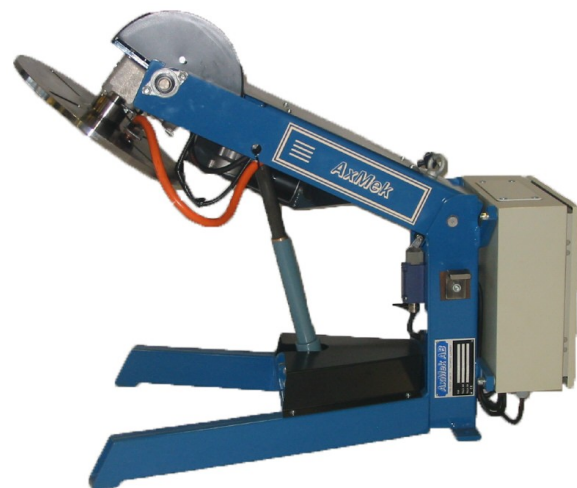
Tilting angle 165°